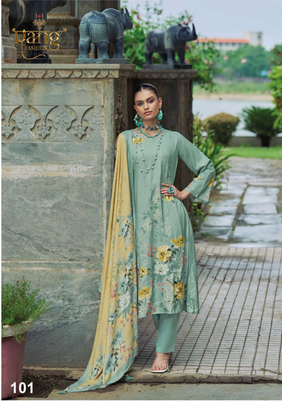
What you wear is how you present yourself to the world, especially today, when human contacts are so quick. Fashion is instant language