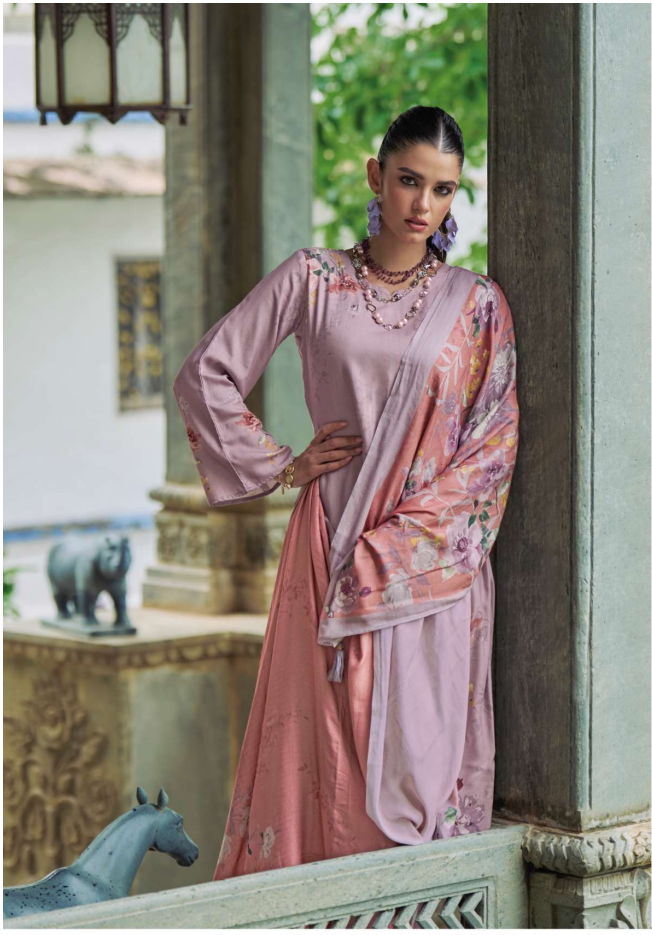
Style is something each of us already has, all we need to do is find it