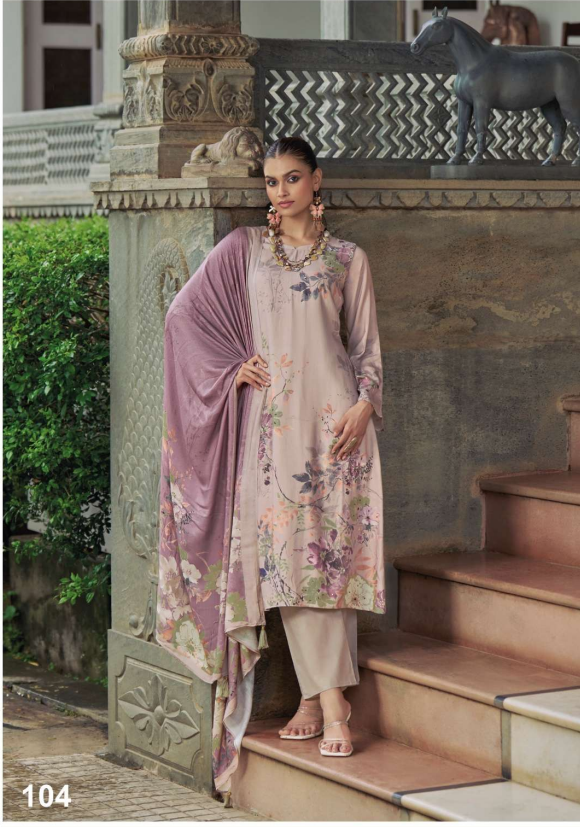
104 What you wear is how you present yourself to the world, especially today, when human contacts are so quick. Fashion is instant language