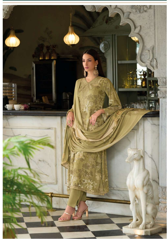
Fashion is the armor to survive the reality of everyday life