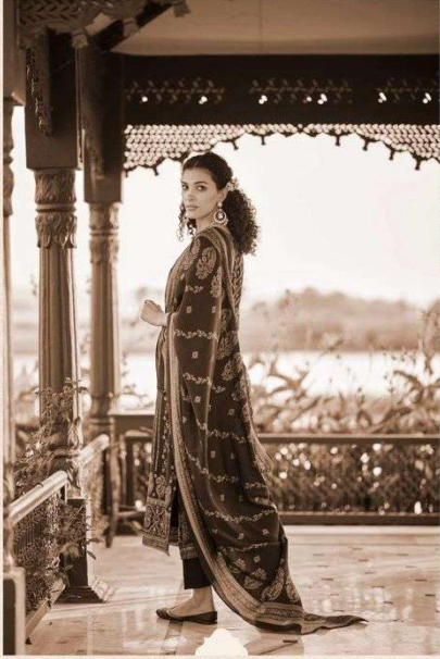
Fashion dress styles blend modern elements with traditional aesthetics adapting to changing fashion trends.

ممتاز آرٹس MUMTAZ ARTS Purveyors of Elegance