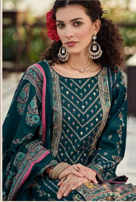
Learning to drape a dress is an art with different regions having their own draping styles.

ممتاز آرٹس MUMTAZ ARTS Purveyors of Elegance