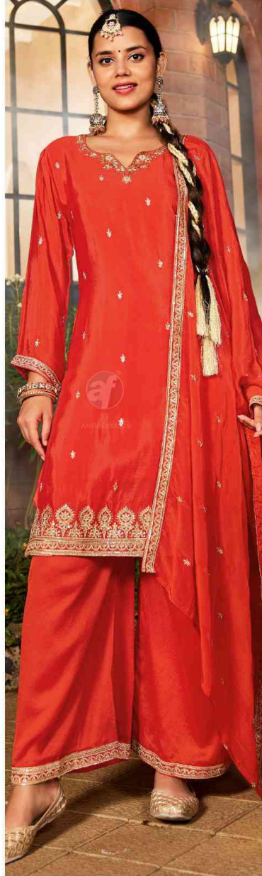
4192 **** Sahiba VOL-07