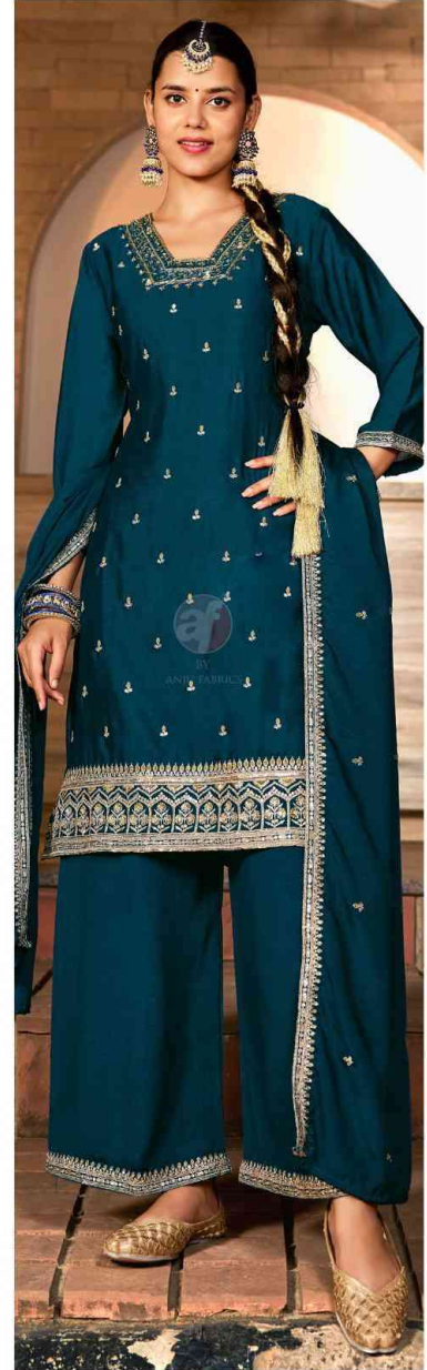
4196 **** Sahiba VOL-07

Style :- Short kurta with divider & dupatta