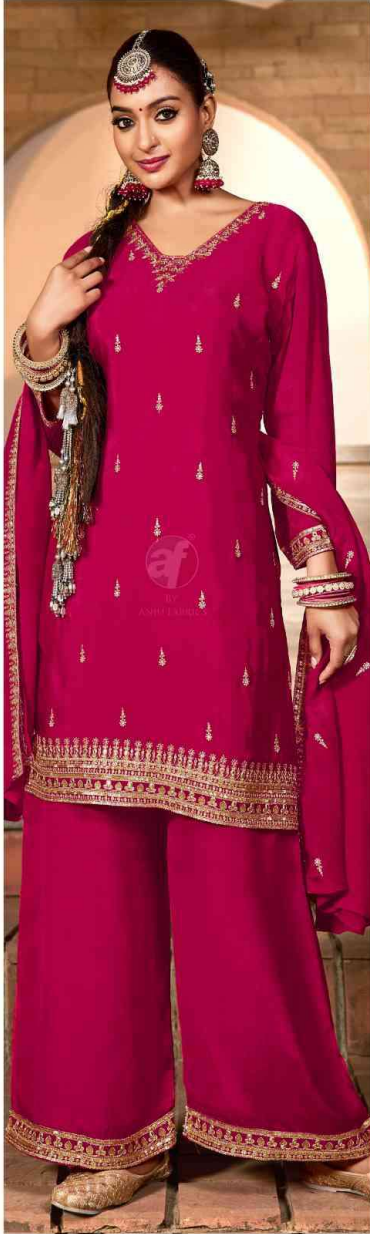
4194 **** Sahiba VOL-07