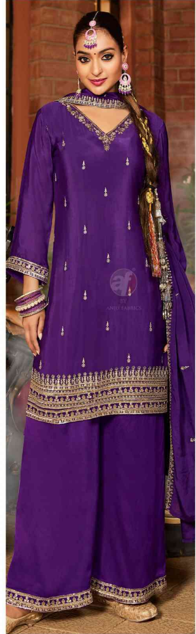
4193 **** Sahiba VOL-07