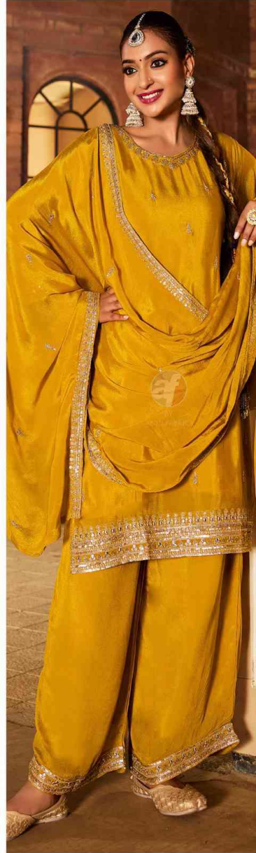
4195 **** Sahiba VOL-07