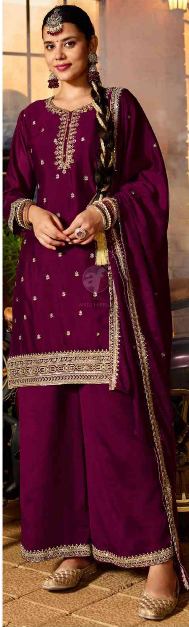
4191 **** Sahiba VOL-07