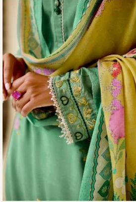
STYLE STATEMENT 201