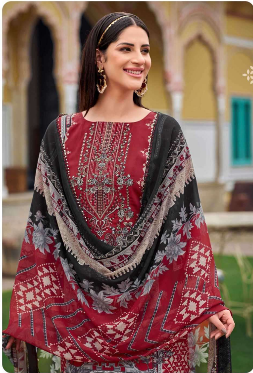
CULTURAL HERITAGE :