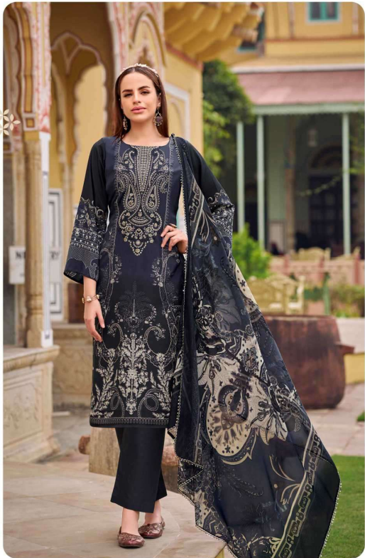
SPARK AND SHINE