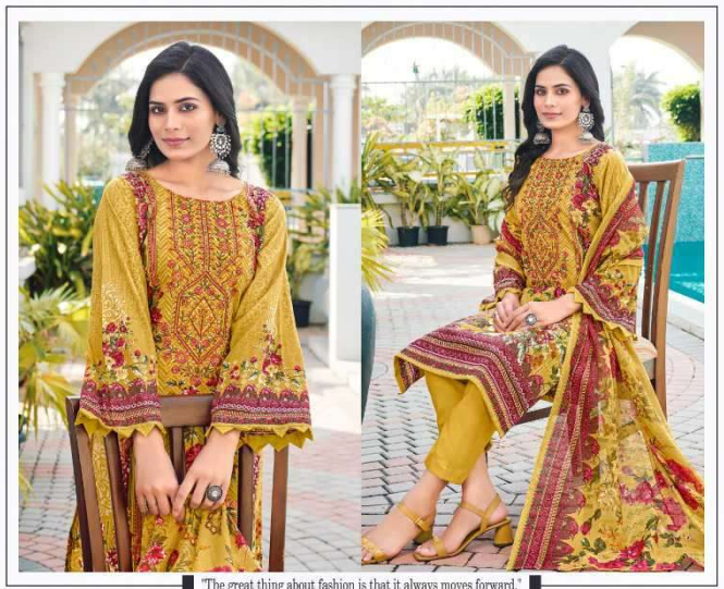
The great thing about fashion is that it always moves forward.