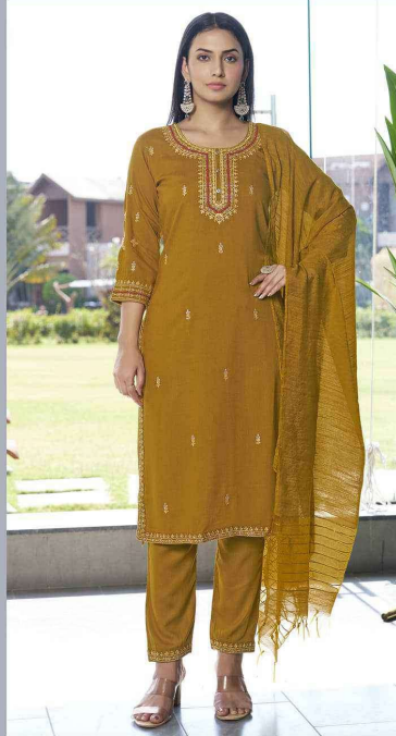
D.NO : 2002