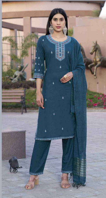
D.NO : 2005