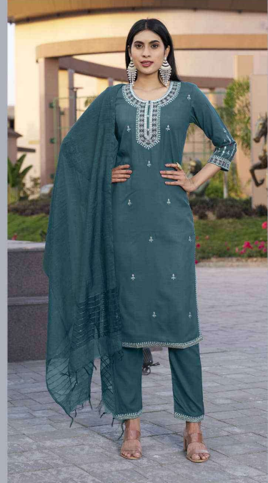
D.NO : 2003