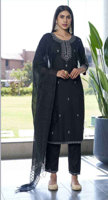
D.NO : 2001