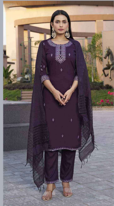
D.NO : 2006