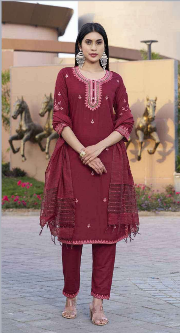
D.NO : 2004