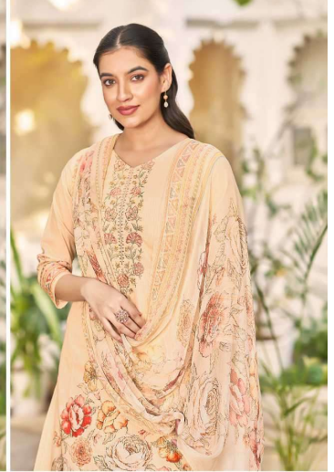
2638 - B