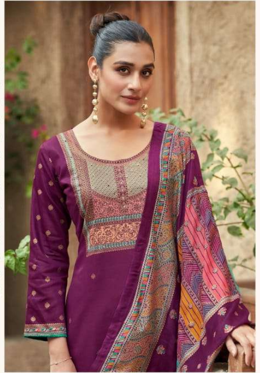
The ethnic elements of Indian Fashion from traditional motifs to customary essential hints of folk and vibrant regional colours.