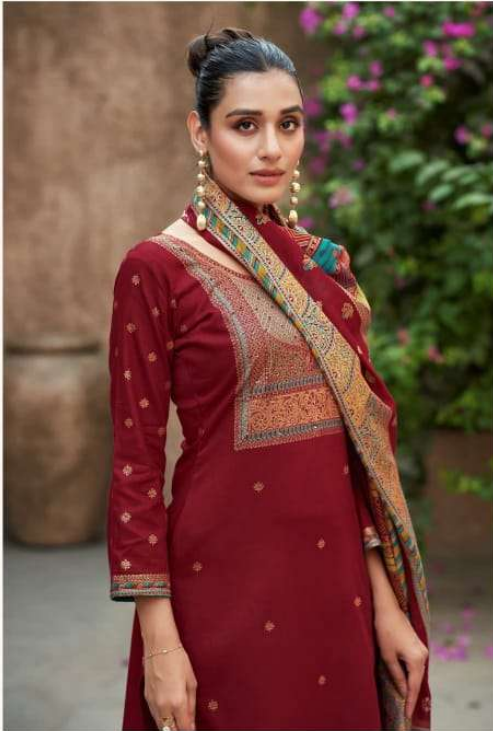
The ethnic elements of Indian Fashion from traditional motifs to customary essential hints of folk and vibrant regional colours.