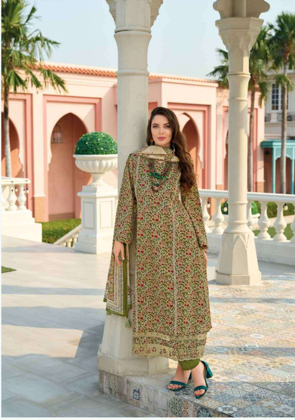
CLASSY AND FABULOUS A GIRL SHOULD BE TWO THINGS : CLASSY AND FABULOUS