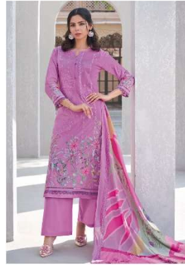
{ 107 }