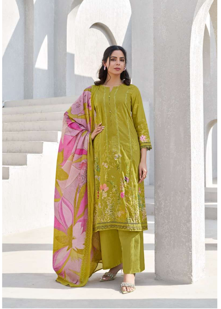
{ 105 } A celebration of style in every fold.