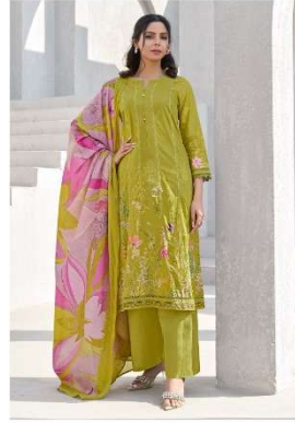
{ 105 }