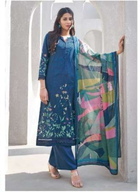
{ 108 }