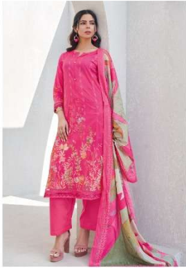
{ 103 }