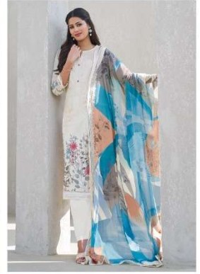
{ 106 }