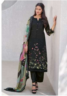
{ 104 }