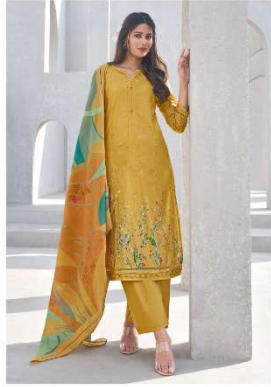
{ 102 }