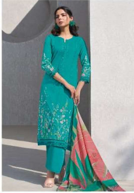
{ 101 }