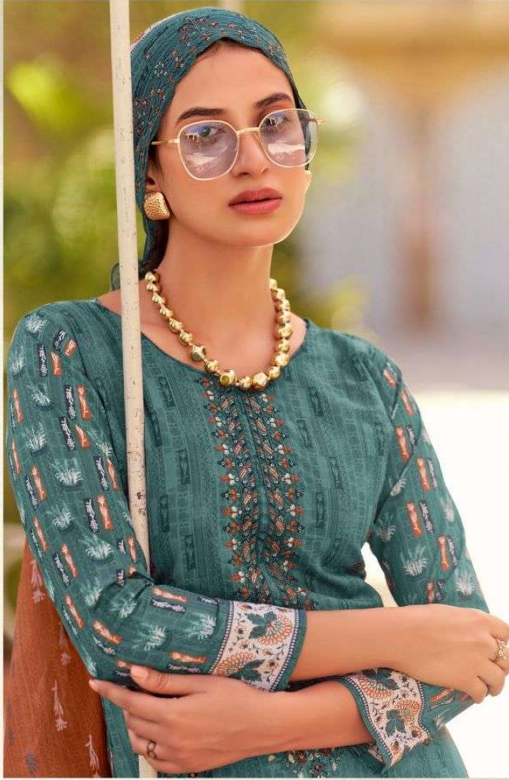
Enchanting charm, beauty beyond the stars!