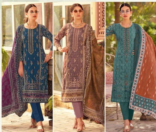
D.No. 2001 ***