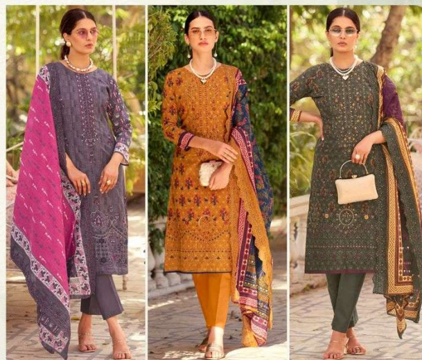
D.No. 2004 ***