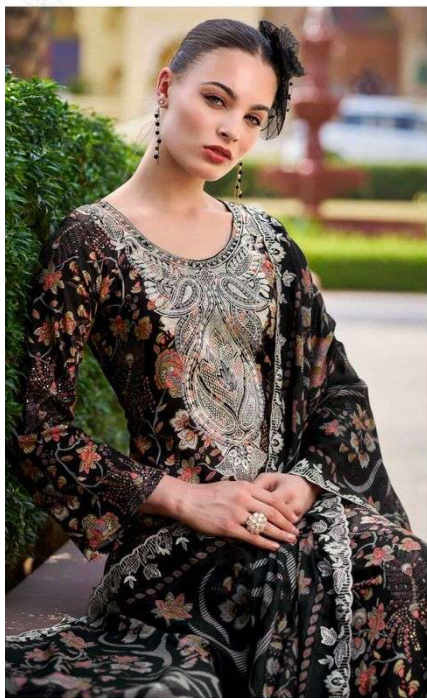
A canvas of fabric, painted with legacy.