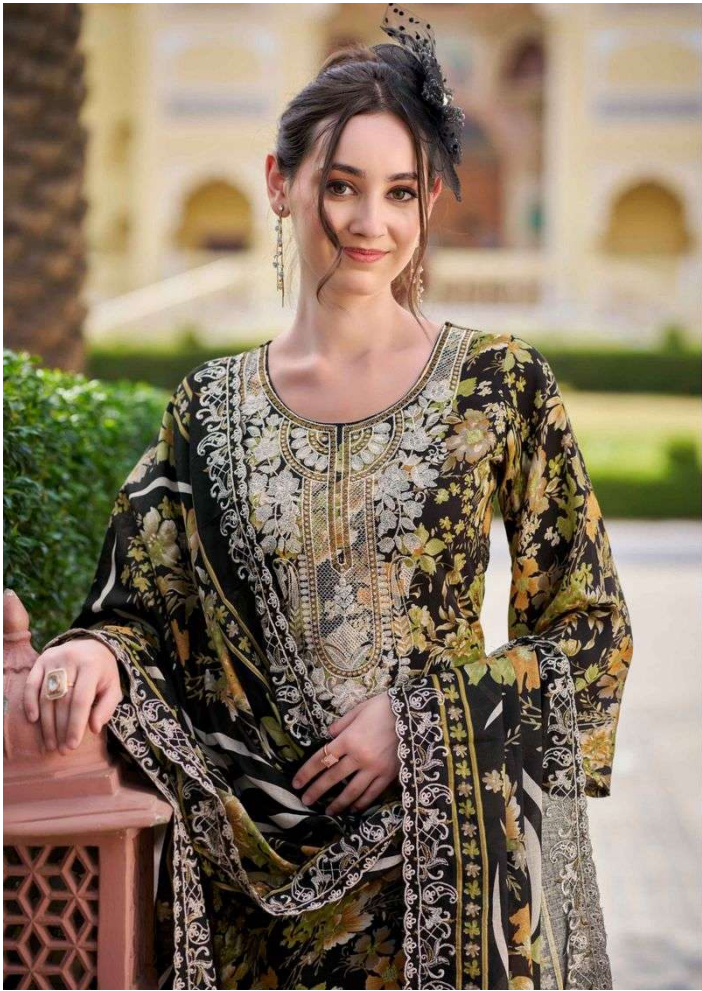
Threads of tradition woven with today's soul.