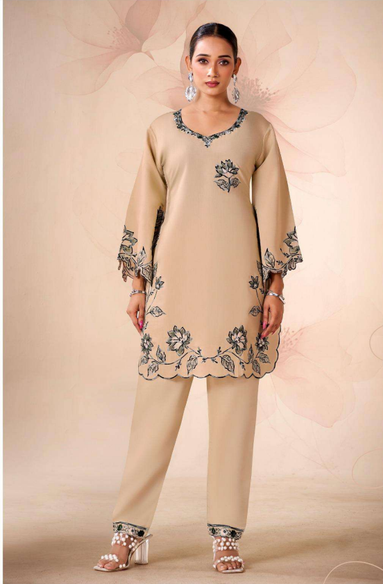
The silent colours and beautiful print provide a spark to the persona. 318-004