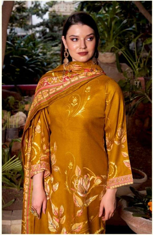
Unique shade of red and the warmth of subtle print is together an avalanche of beauty.