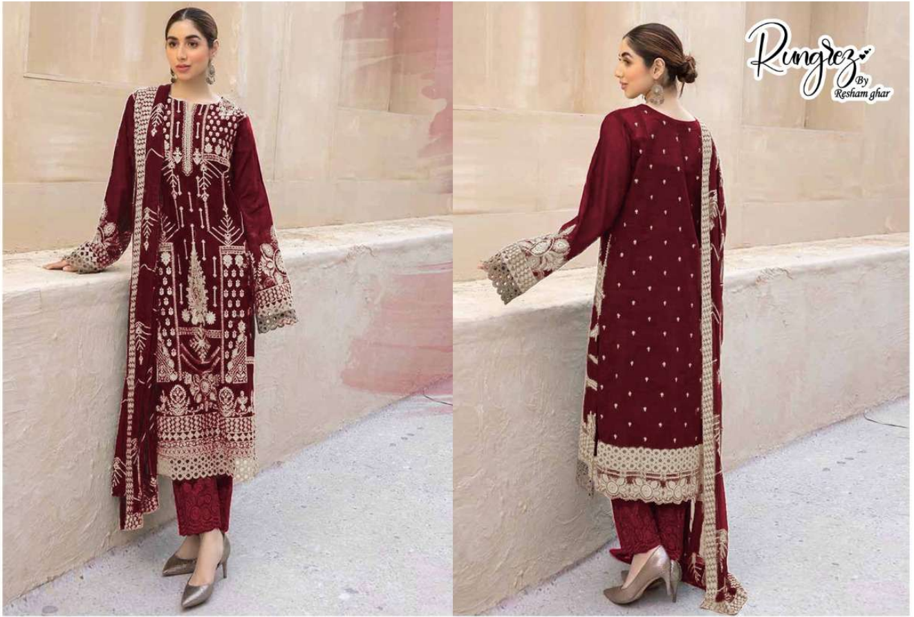
TOP : HEAVY EMBROIDERY WITH STONE WORK BOTTOM : SANTOON WITH EMBROIDERY PATCH DUPATTA : HEAVY EMBROIDERY WORK WITH LACE WORK