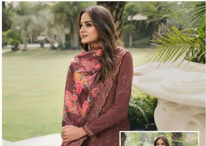
Hit refresh on your style with embroidered suit & print dupatta.