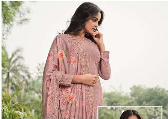
■ This season's blooming pieces for a radiant you!