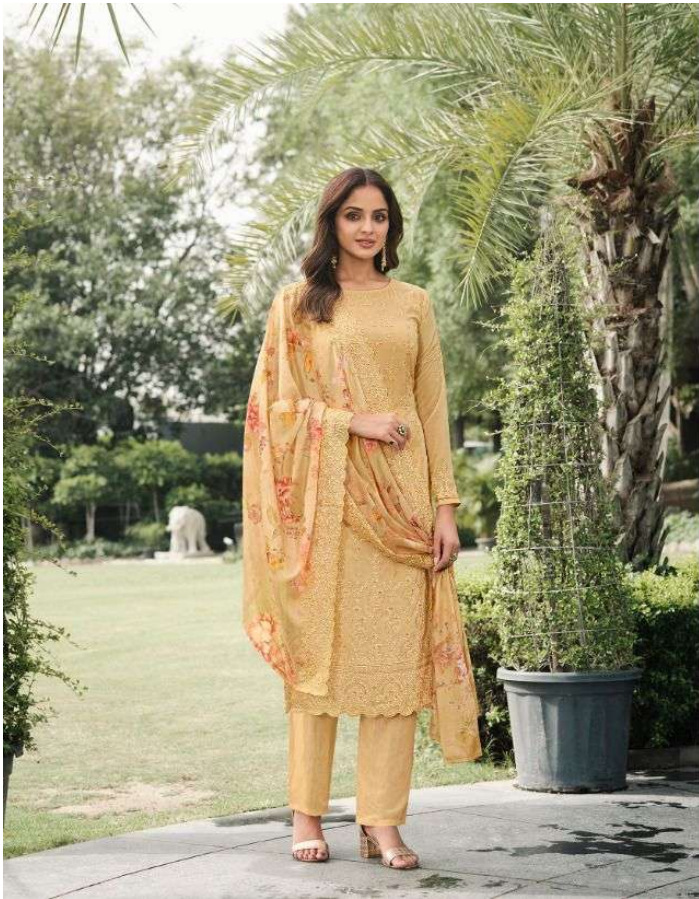
■ Striking the right balance between subtle and dramatic.