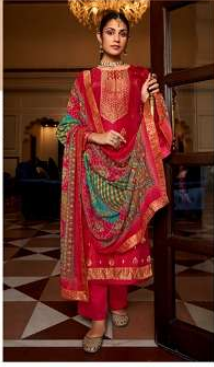
MANDAKINI | 7003