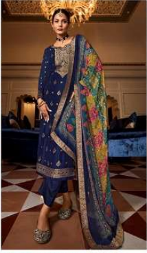
MANDAKINI | 7006