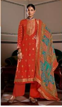
MANDAKINI | 7001