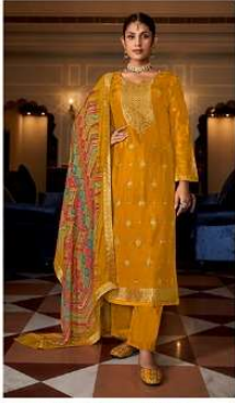
MANDAKINI | 7007