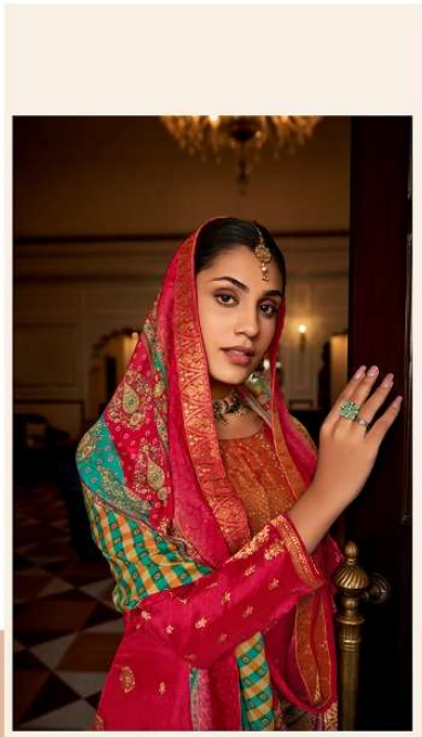
MANDAKINI | 7003