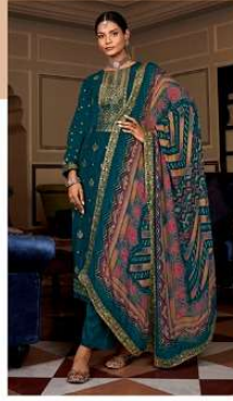
MANDAKINI | 7004