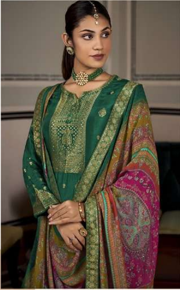
MANDAKINI | 7002