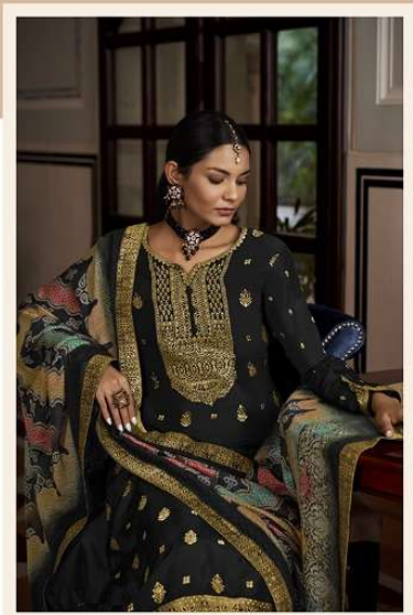
MANDAKINI | 7008