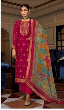
MANDAKINI | 7005