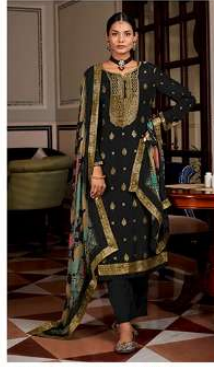
MANDAKINI | 7008