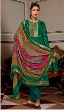
MANDAKINI | 7002