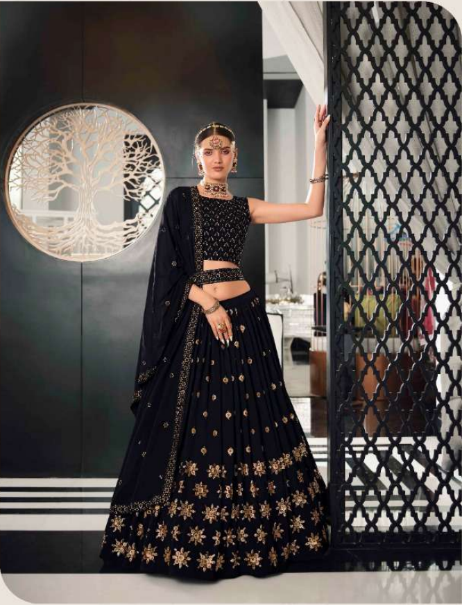
Popping up bright hues as an easy pattern with a maneuvering of delicate floral motifs - it's just the way we designed her in.