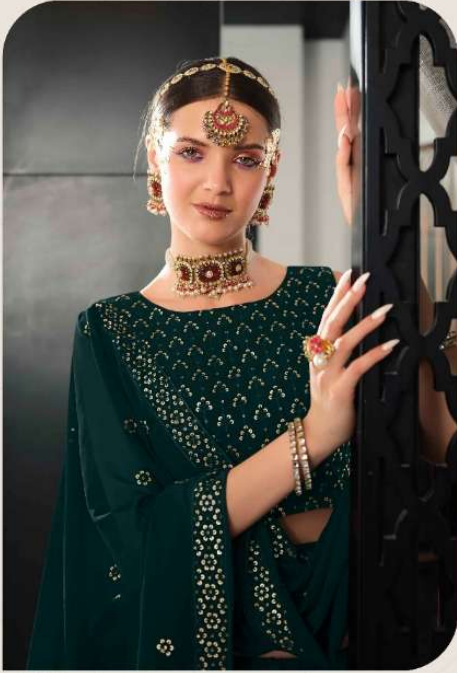
Peeping up bright hues on ammy palette, with a counting of delicate floral motifs - it's just the traditional charm. #2156