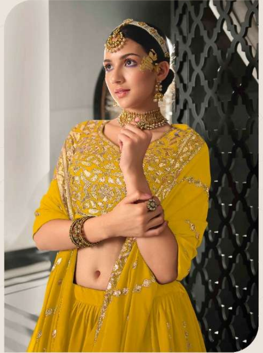
Peeping up bright hues on an eerie palette with a manipulation of delicate faded motifs – it's just the old traditional charm. #2153