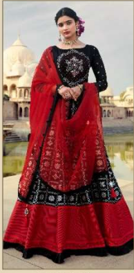
• 1002 •