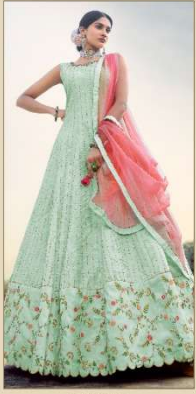
• 1001 •