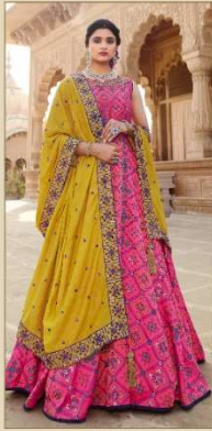
• 1004 •