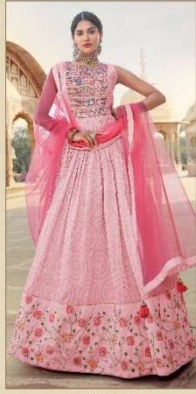
• 1003 •