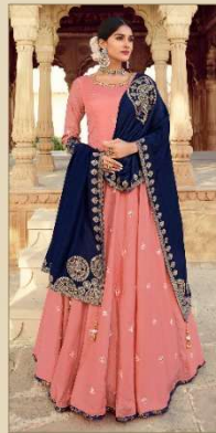
• 1006 •