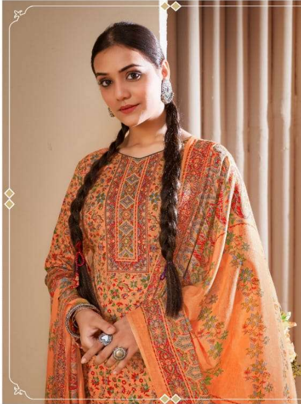
Perfection is inspired by youth & courage & comes inspiration from the heart of the artist. I dress for the stage, not for myself, not for the public, not for feedback, not for likes.