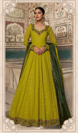
◉ 4864 ◉