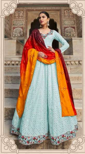
◉ 4861 ◉