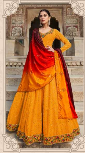
◉ 4863 ◉