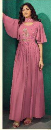
| 1035 |