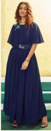
| 1032 |