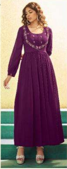
| 1031 |