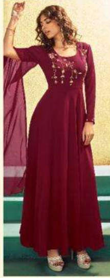
| 1033 |