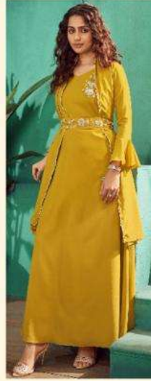
| 1034 |