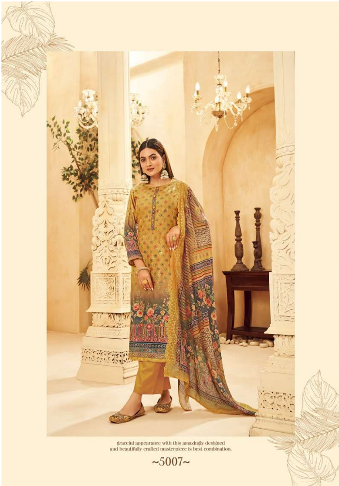
graceful appearance with this amazingly designed and beautifully crafted masterpiece is best combination.