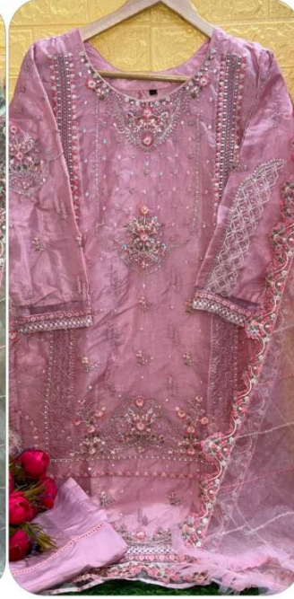
D.No | 206-C