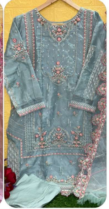
D.No | 206-D