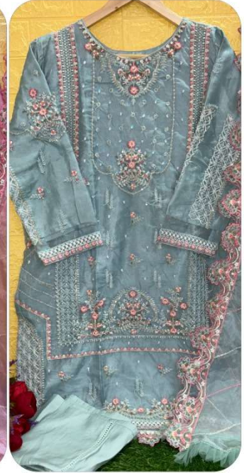
D.No | 206-D