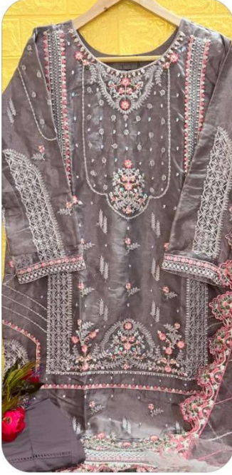
D.No | 206-A

DUPATTA --ORGANZA WITH HEAVY EMBROIDERY WITH FRILL