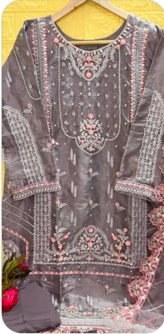
D.No | 206-A

DUPATTA --ORGANZA WITH HEAVY EMBROIDERY WITH FRILL