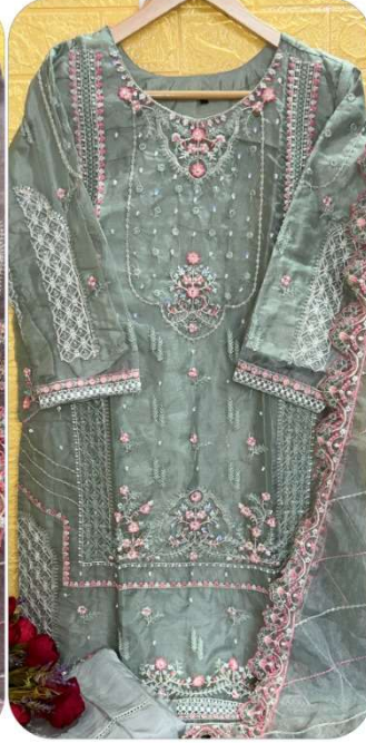
D.No | 206-B