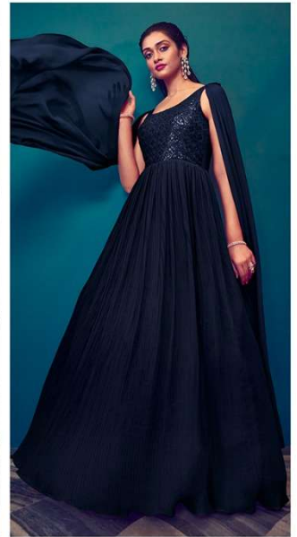
CODE + 4964