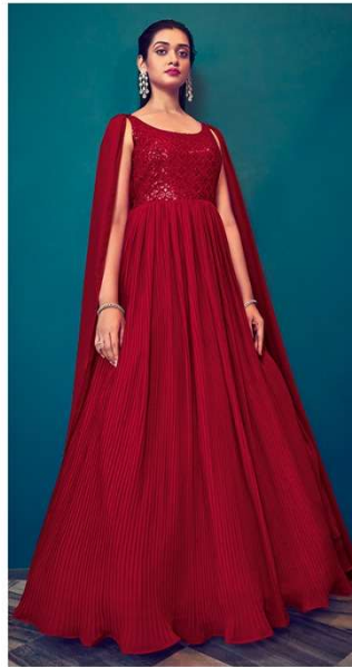
CODE + 4962