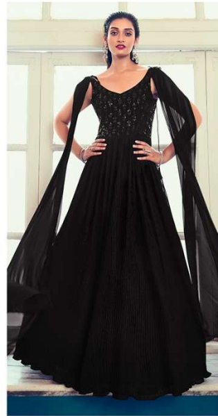
CODE + 4963