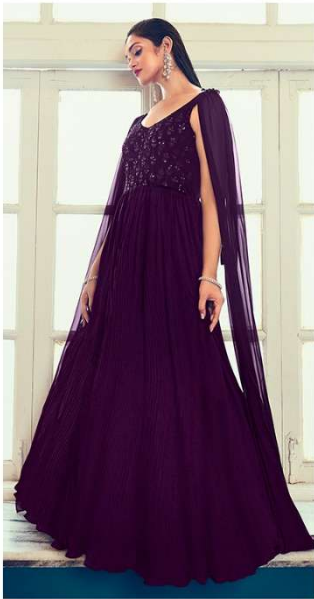
CODE + 4961