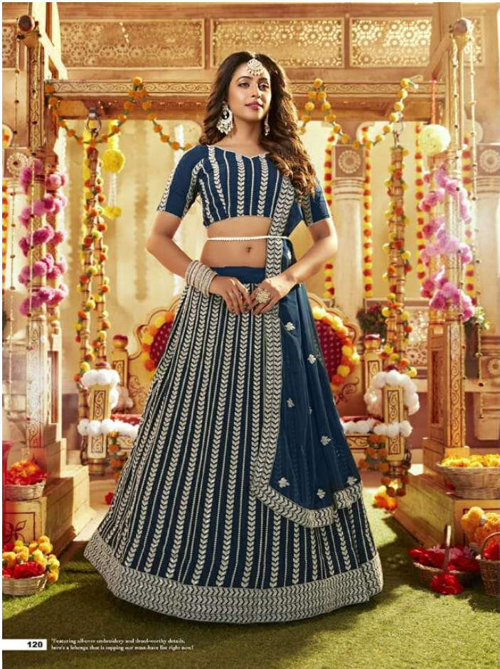
120 Featuring ethereal embroidery and decadent details, here's a lehenga that is rapping our senses the right way!

Wispy Wonders: Classics with a contemporary twist are always top picks! शी matee fashion