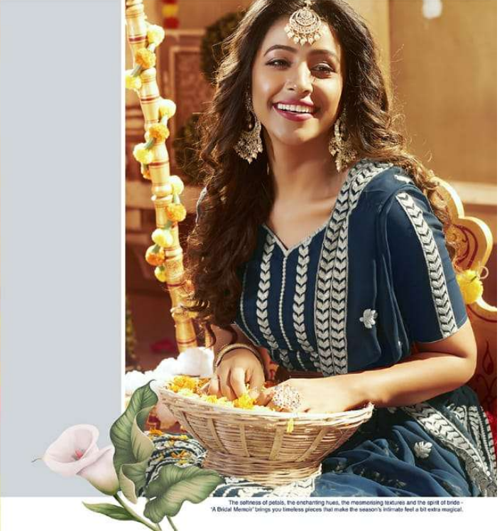
The softness of petals, the enchanting hues, the mesmerizing textures and the spirit of bride - 'A Bride's Moment' brings you timeless pieces that make the season's intimate feel a bit extra magical.

Wispy Wonders: Classics with a contemporary twist are always top picks! शी matee fashion