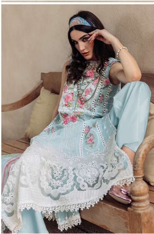
TIME TO shine I love fashion and that's how I express myself