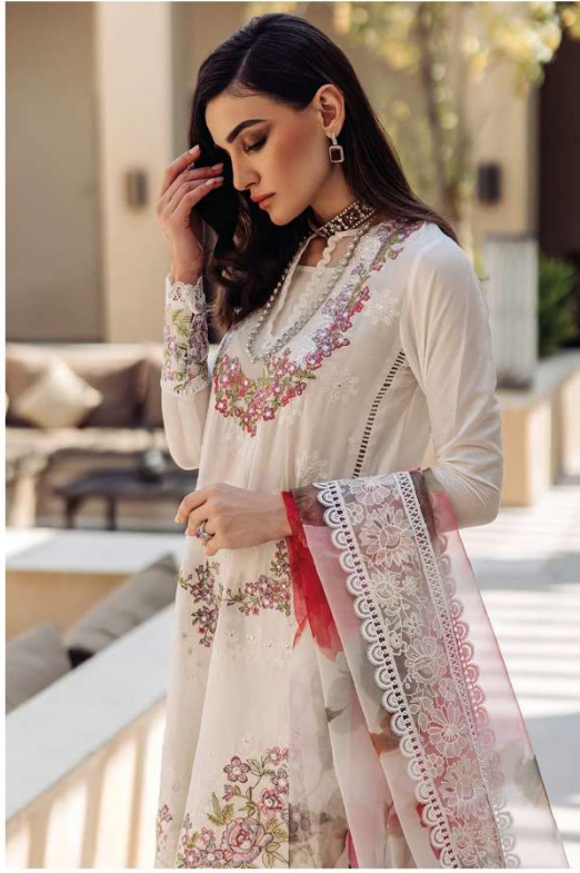
BEAUTY & THE BEAST I love fabrics and that's how I express myself