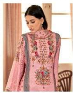
THE BLOOMING BOUTIQUE DESIGNED BY ANZARA D.No.3005