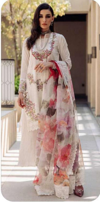
D.No | 202 A