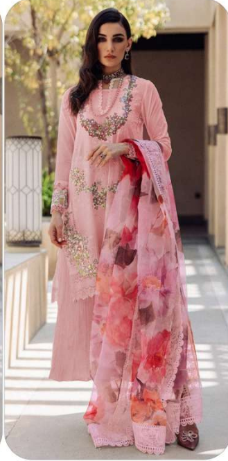
D.No | 202-B