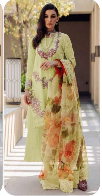
D.No | 202-D