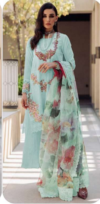
D.No | 202-C