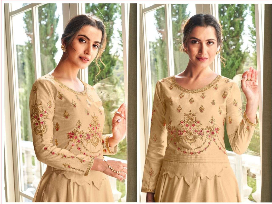
BY THE PATTERNS & VIBRANT COLORS OF POISONOUS YET BEAUTIFUL CREATURES.