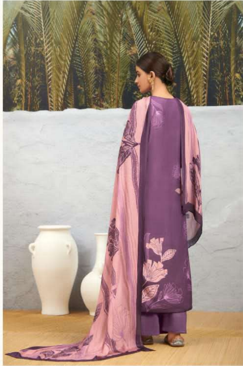
• 512 • MAHI