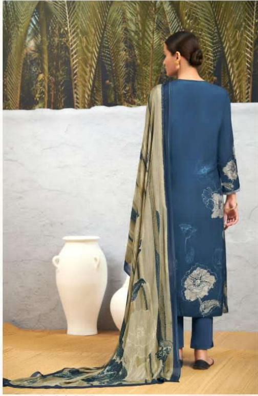
• 556 • MAHI