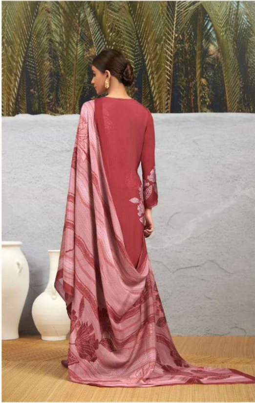
• 518 • MAHI