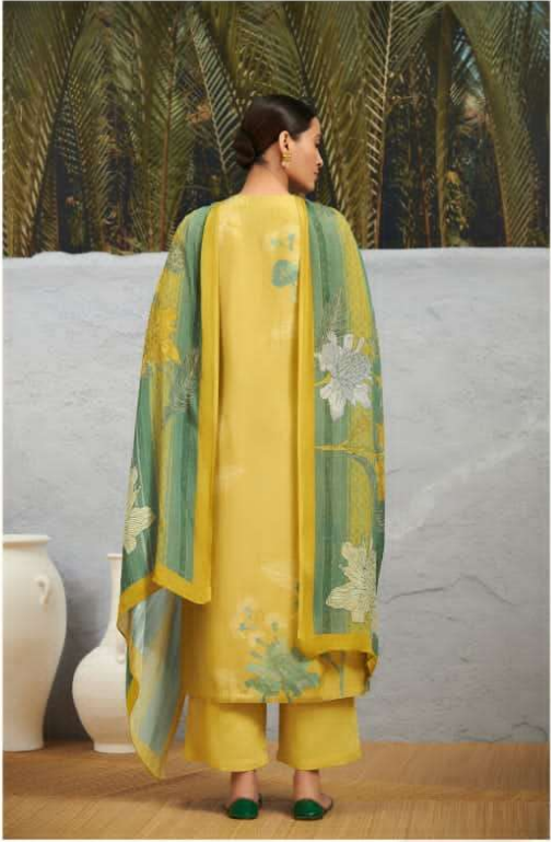
• 536 • MAHI