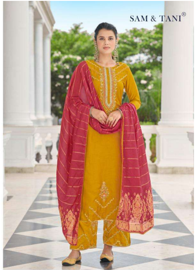
Evoke your ethnic ethos with this beautifully crafted dress with embroidery details. 02