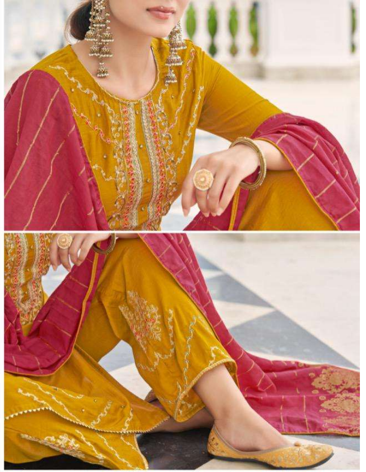
Evoke your ethnic ethos with this beautifully crafted dress with embroidery details. 02